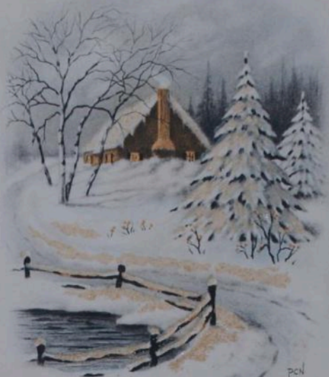
A Country Lane