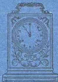
IN ELEGANT CASES. With finely and accurately-finished Move- ments, to strike the hours and half-hours, re- quire winding only once in Eight Days. Warranted—Five Guineas each.