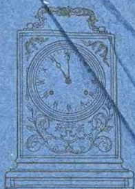
IN ELEGANT CASES. With finely and accurately-finished Move- ments, to strike the Hours and half-hours, re- quire winding only once in Eight Days. Warranted—Five Guineas each.