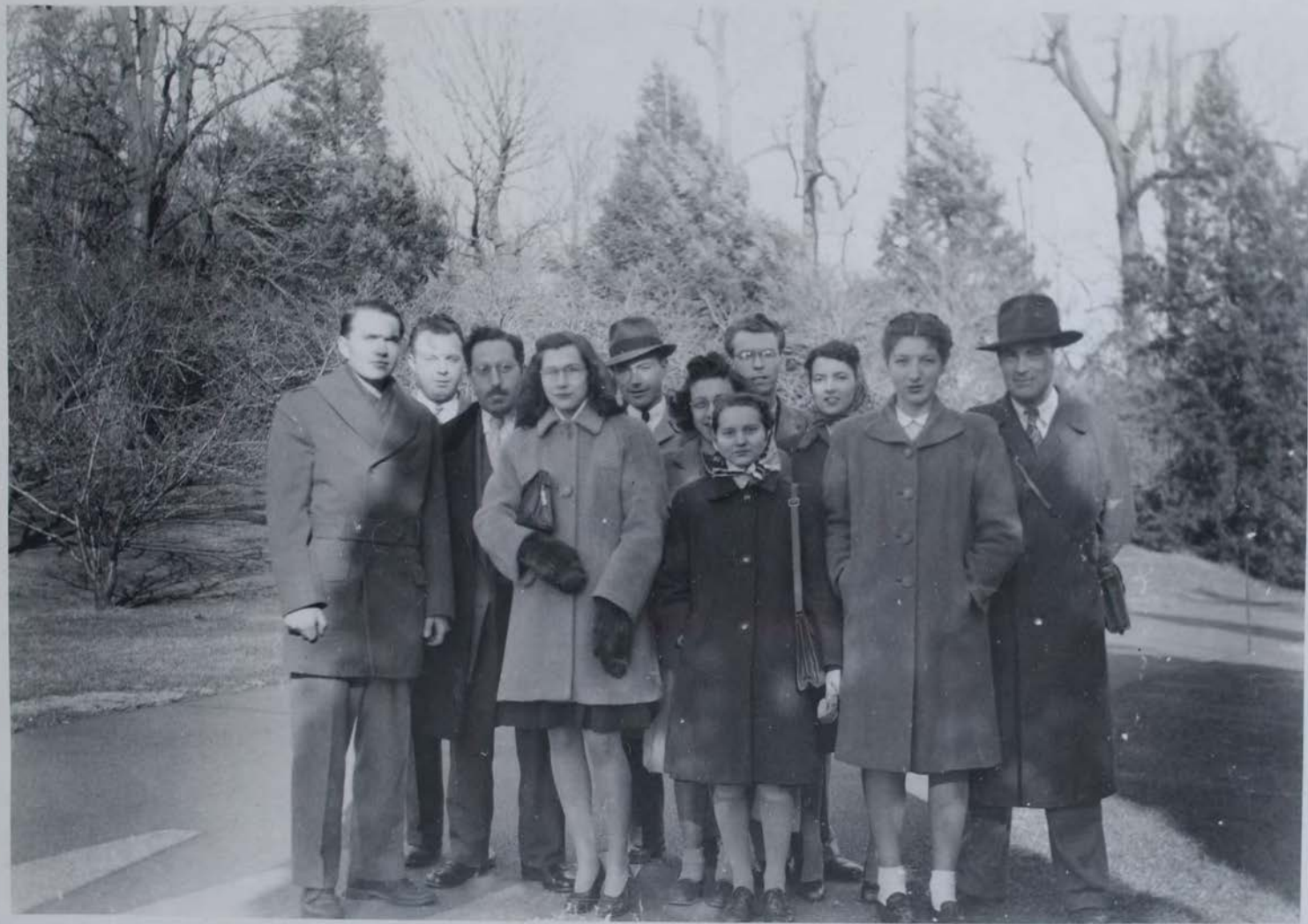
Hunt Institute for Botanical Documentation