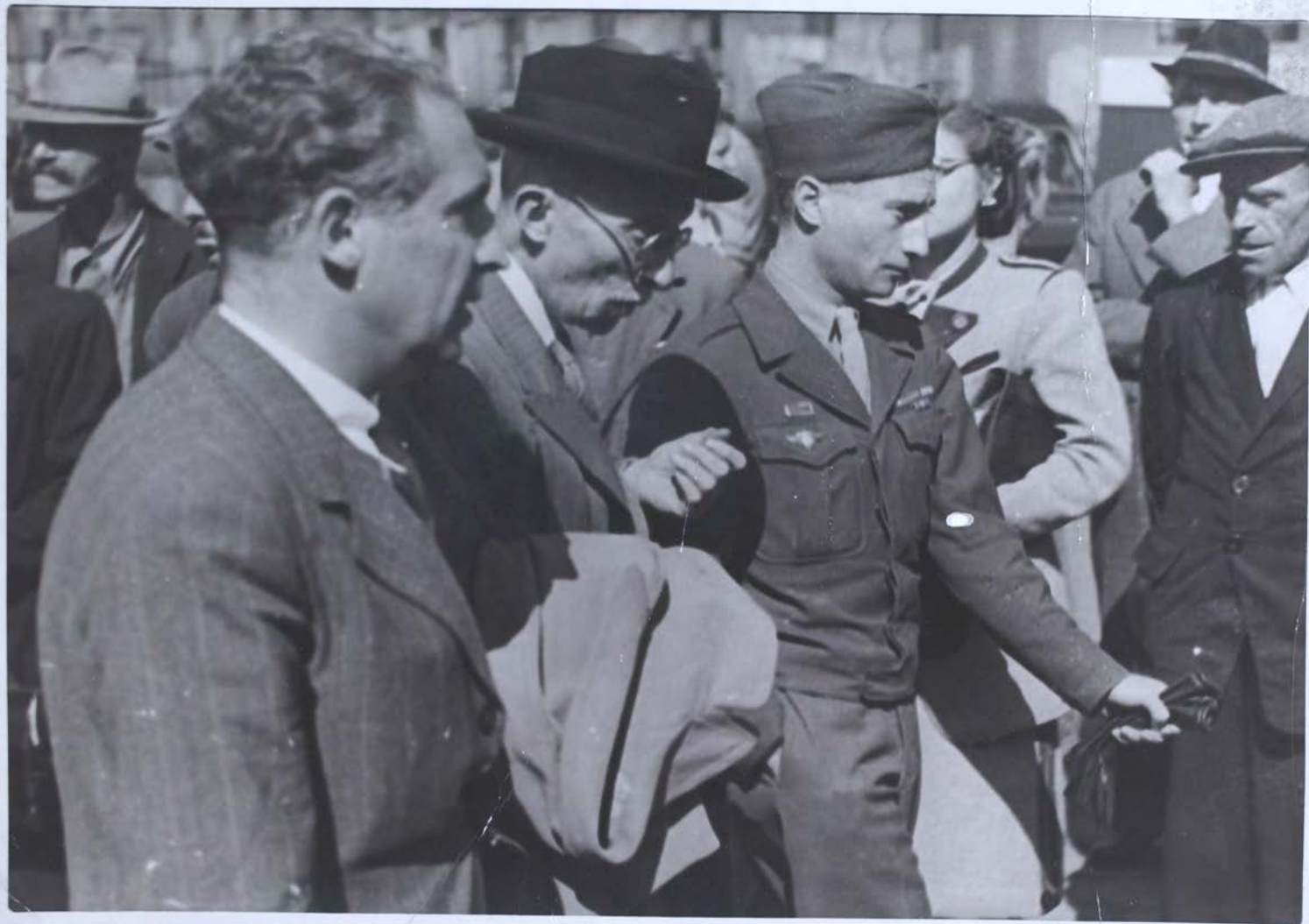
Hunt Institute for Botanical Documentation