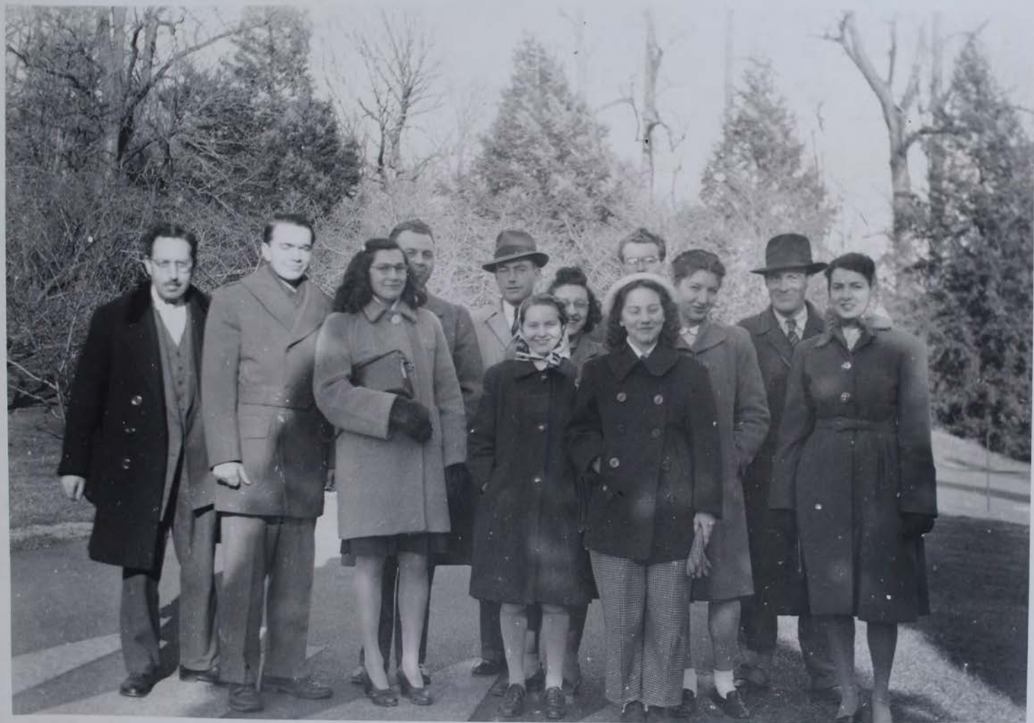
Hunt Institute for Botanical Documentation