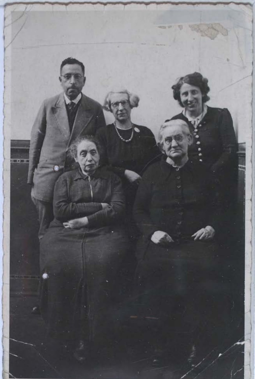
Hunt Institute for Botanical Documentation