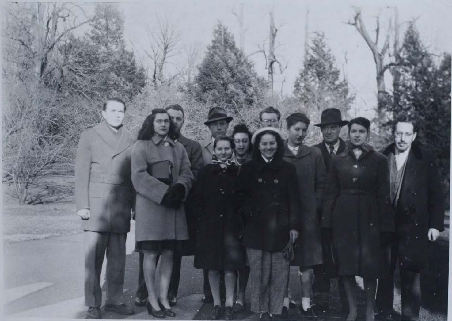
Hunt Institute for Botanical Documentation