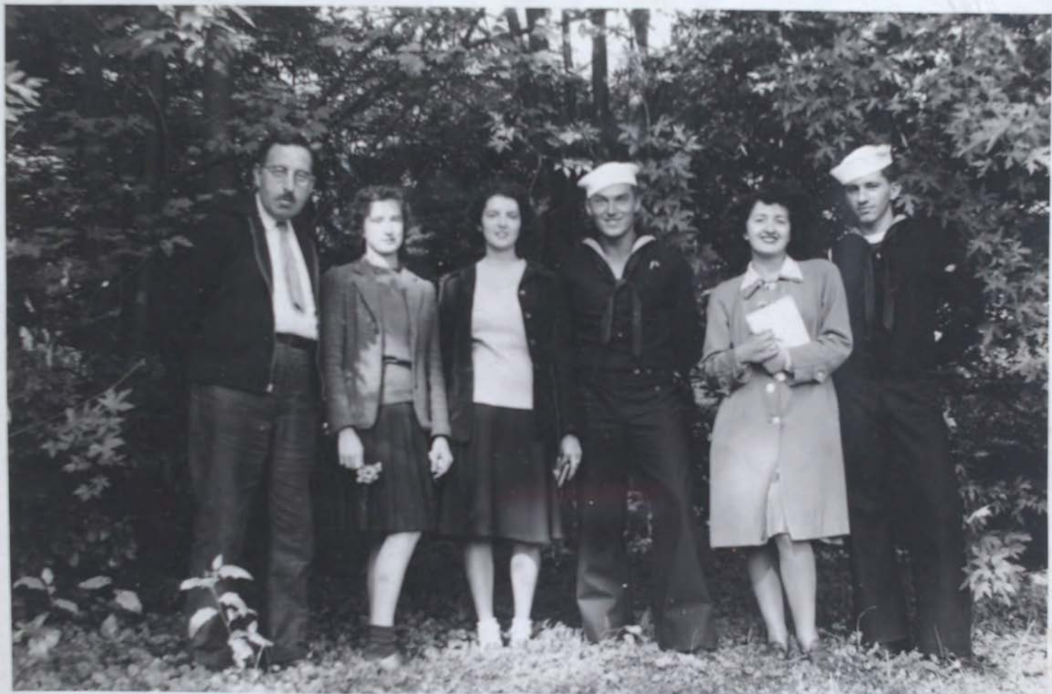
Hunt Institute for Botanical Documentation