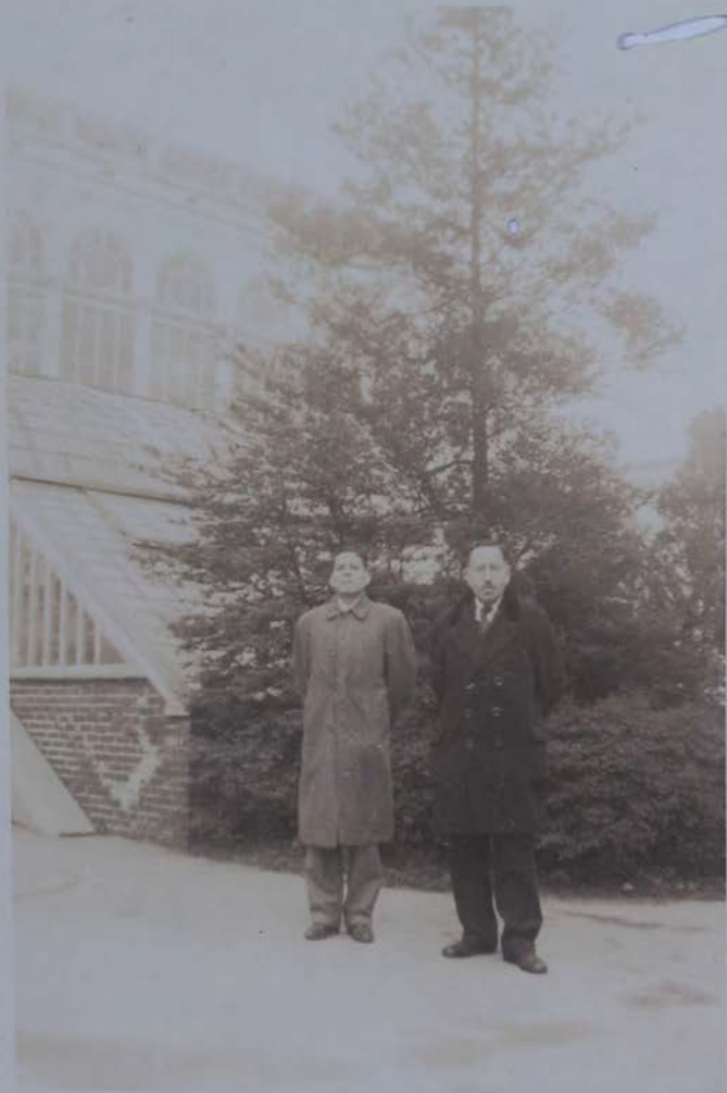
Hunt Institute for Botanical Documentation