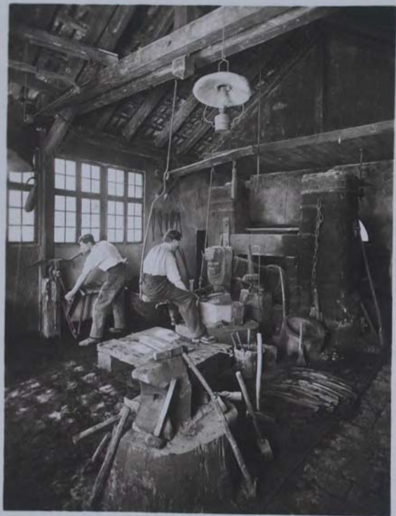
Hunt Institute for Botanical Documentation