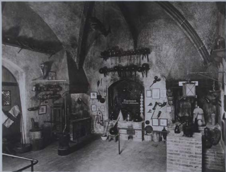
Hunt Institute for Botanical Documentation