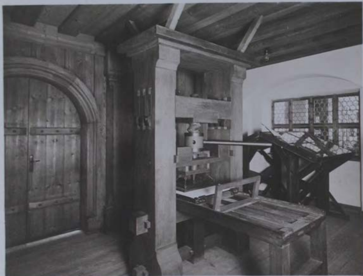
Hunt Institute for Botanical Documentation