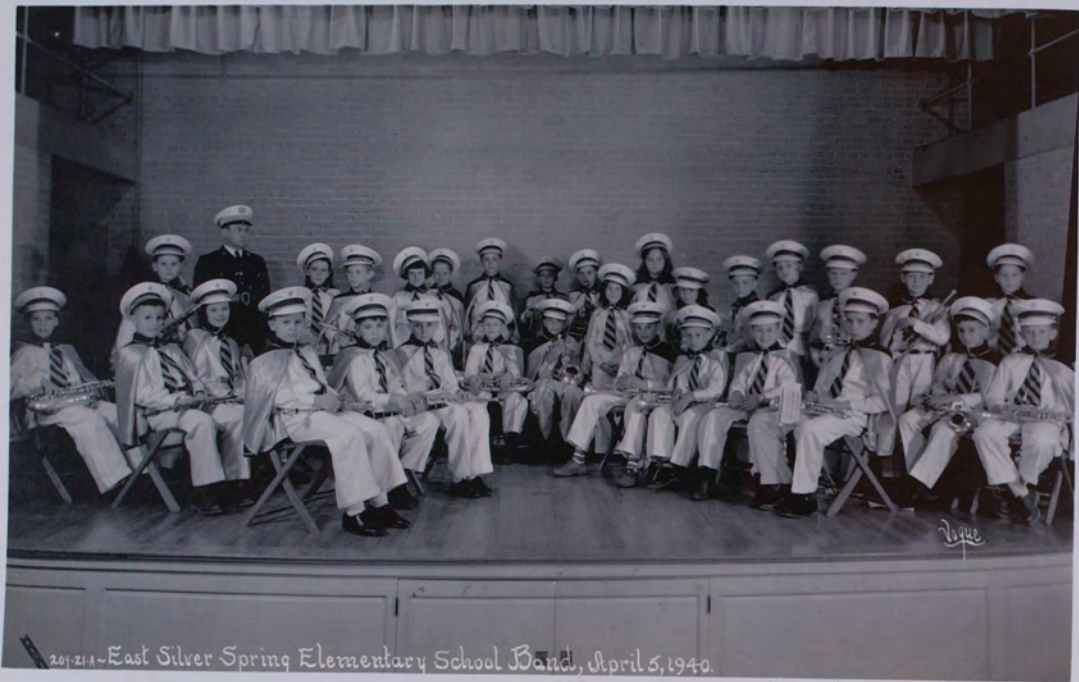
207-21-1 - East Silver Spring Elementary School Band, April 5, 1940.